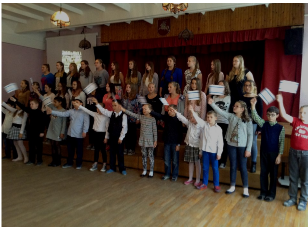
Pupils of Vilnius "Sauletekis" school-multifunctional centre