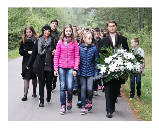
The Executive Director of the International Commission