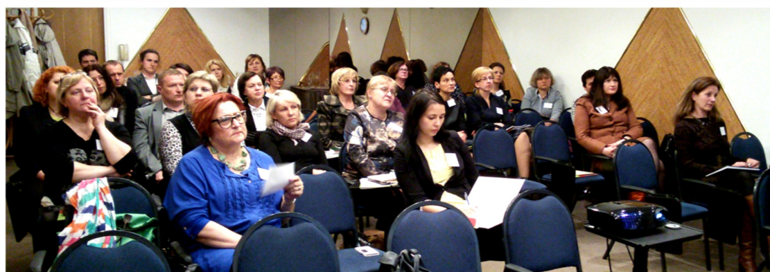
Seminar 17–19 May. The educators are sharing their experience.