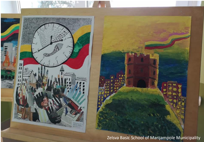
Zelsva Basic School of Marijampole Municipality