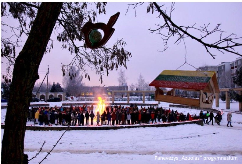
Panevezys „Azuolas“ progymnasium