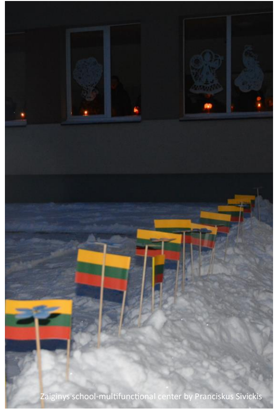
Zaiginys school-multifunctional center by Pranciskus Sivickis