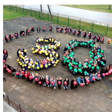
Taurage dis. Zygaiciai gymnasium