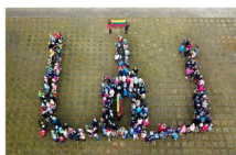
Vilnius "Rytas" progymnasium

In celebration of the thirtieth anniversary of the restoration of Lithuanian independence, 175 education institutions of Lithuania joined the civic initiative The living flower of the nation .