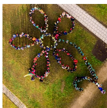
Rokiskis Senamiestis progymnasium