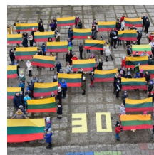
Vilnius Sausio 13-osios progymnasium