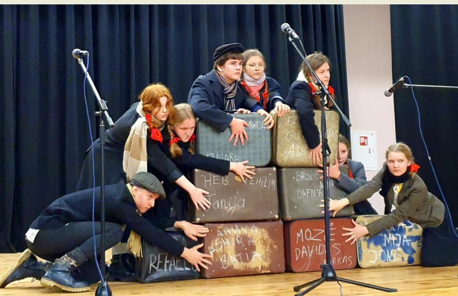
Alytus district Daugai Vladas Mironas gymnasium