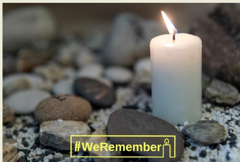
Government of the Republic of Lithuania, photographer Laima Penek