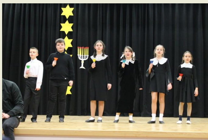
The artistic composition of Alytus Tolerance Education Centers