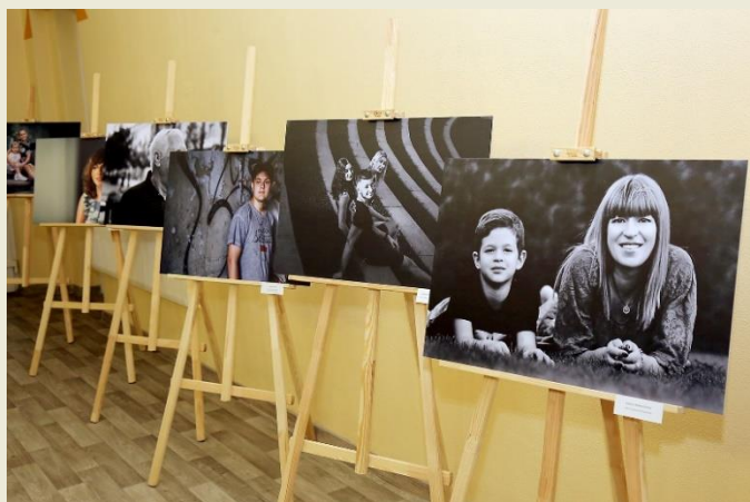
The exhibition of photographs "Jews then and now..."

International Holocaust Remembrance Day was observed in many Tolerance Education Centres. Teachers organized lessons to commemorate the date, film screenings, school conferences, and presentations of the projects on the Holocaust.