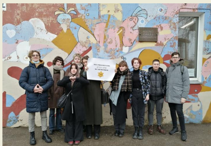
Kaunas Art gymnasium