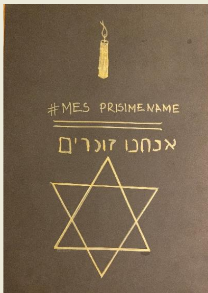
Antano Vienuolio Pro-Gymnasium in Vilnius