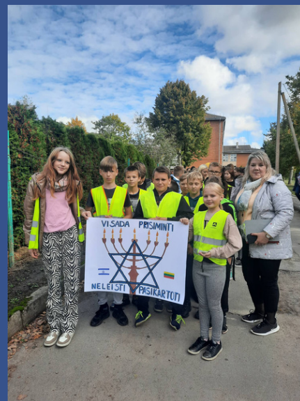
Radviliškis district, Šiaulėnai Marcelinas Šikšnys gymnasium