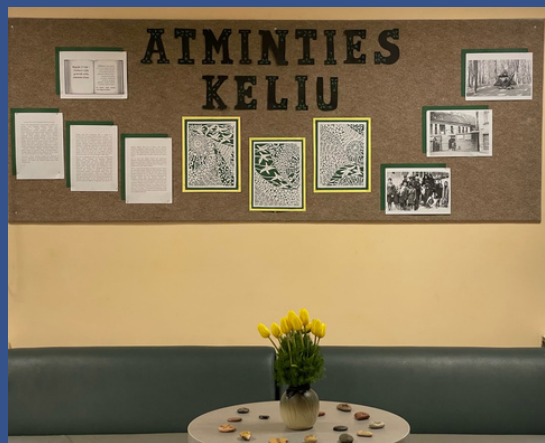
Visaginas Žiburys primary school