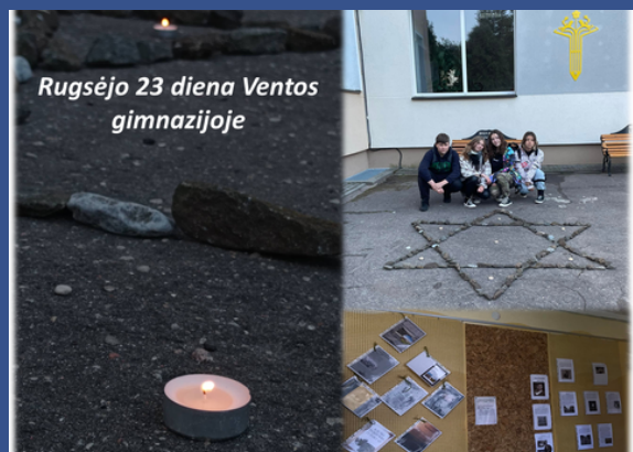
Akmenė district, Venta gymnasium