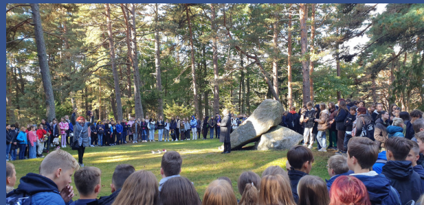
Palanga Vladas Jurgutis progymnasium