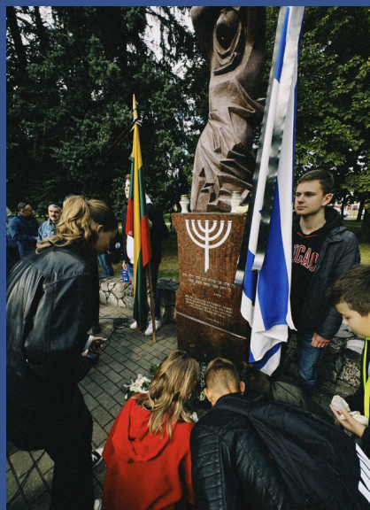
Panevėžys J. Balčikonis gymnasium