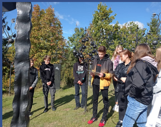
Plungė district, Liepijai school