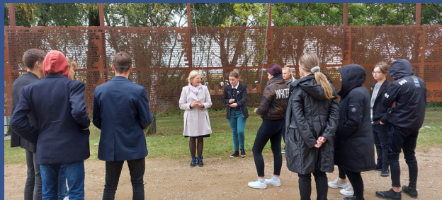
Kėdainiai district, Surviliškis Vincas Svirskis primary school