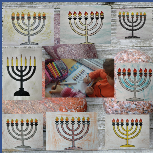
Jurbarkas "Ažuoliukas" school