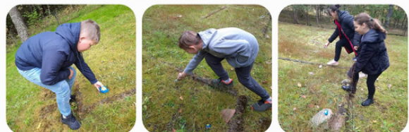
Raseiniai district, Nemakščiai Martynas Mažvydas gymnasium