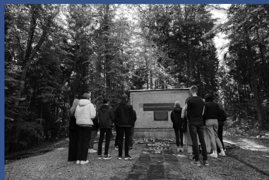
Klaipėda university "Žemyna" gymnasium