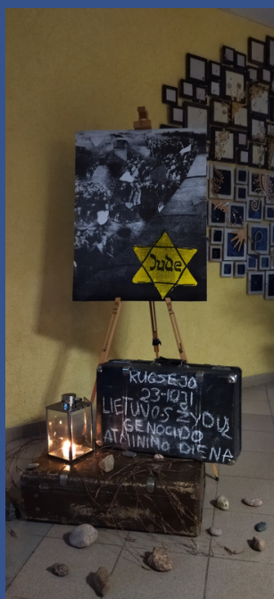
Klaipėda university "Žemyna" gymnasium