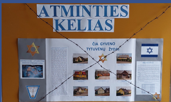
Kelmė vocational training centre, branch of Tytuvėnai