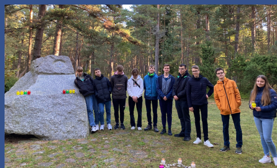
The Old gymnasium of Palanga