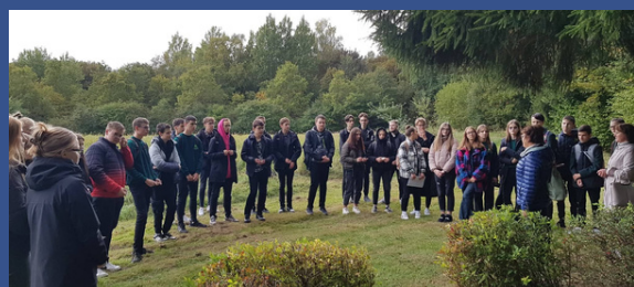
Radviliškis Lizdeika gymnasium