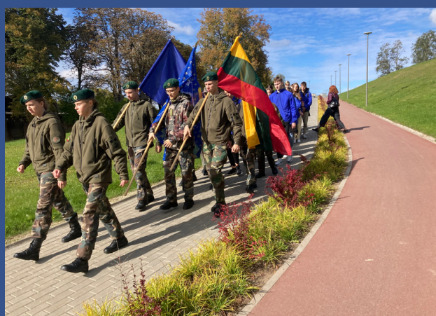
Mažeikiai Gabija gymnasium

Around 160 institutions participated in the commemoration events "The Road of Memory": public education institutions and museums in Lithuania, culture centres, municipalities, and libraries in several districts organized activities to commemorate the destruction of local Jewish communities. Some schools and other institutions organized a Road of Memory – a walk or bus trip to the site of the victims of the Holocaust. Some schools organized lessons, film screenings and discussions, and other commemorative events.