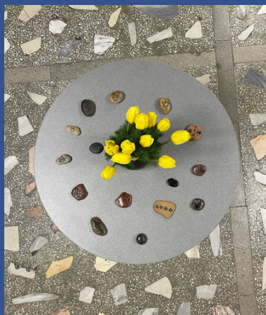
Visaginas Žiburys primary school