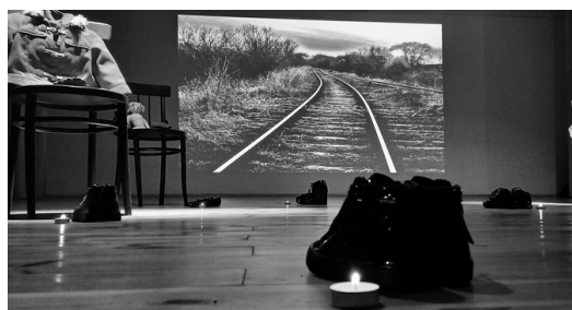
Vilkaviškis Salomėja Nėris basic school