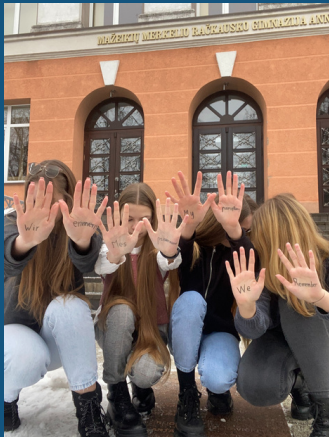
Mažeikiai Merkelis Račkauskas gymnasium