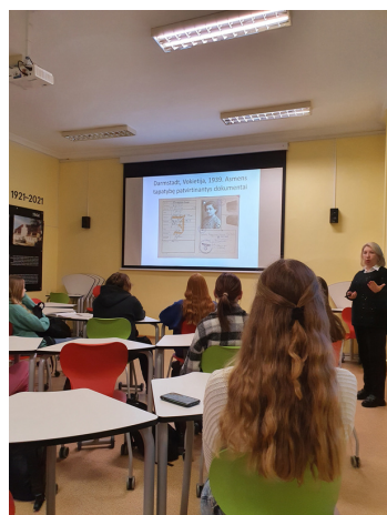
Kelmė Jonas Graičiūnas gymnasium

Integrated lessons, film screenings, and discussions were organized in educational institutions, as well as presentations of artistic productions and performances on the Holocaust to local communities.