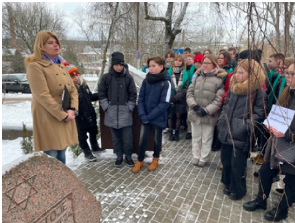
Šiauliai Gegužiai progymnasium