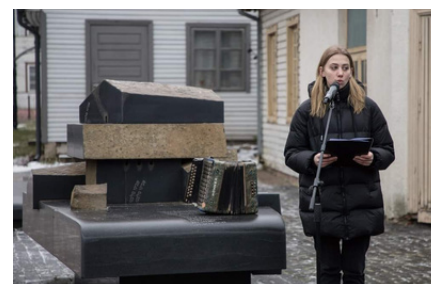
A commemoration event at the memorial of the synagogues square of Jurbarkas