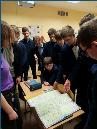
Kaunas Jonas ir Petras Vileišiai School