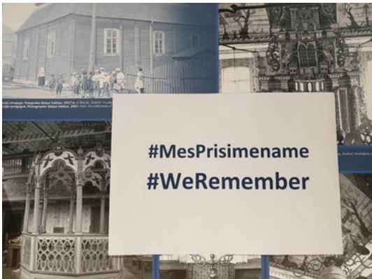
The synagogue of Pakruojis