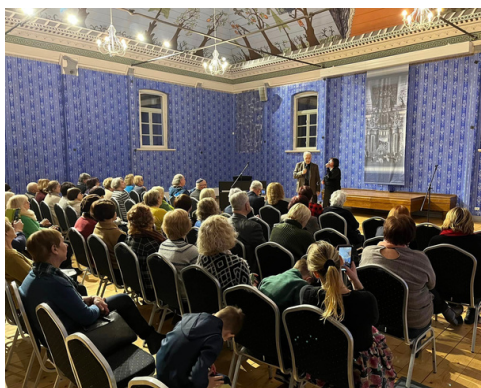
An event at the synagogue of Pakruojis