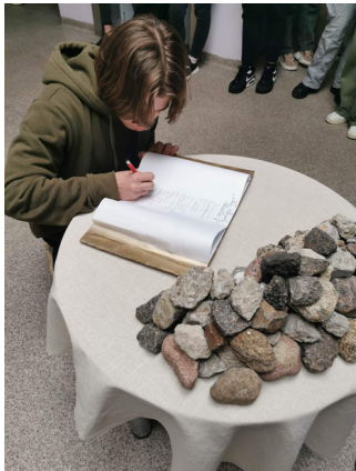
Vilnius district Lavoriškės gymnasium

From 23 to 27 January, Lithuanian schools with Tolerance Education Centres held commemorative events to remember the murdered Jews of Lithuania and to mark International Holocaust Remembrance Day.