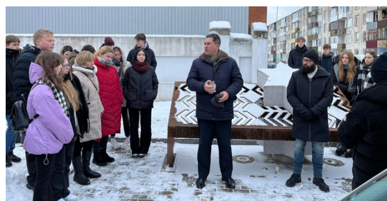
The commemoration event at the Square of the Righteous Among the Nations in Šiauliai

Some students and their teachers from the Centres for Tolerance Education visited the mass murder sites of Jews close to towns and townships.