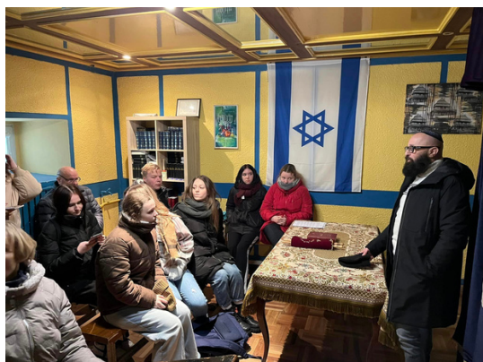
Pupils' visit at the Jewish Community of Šiauliai district