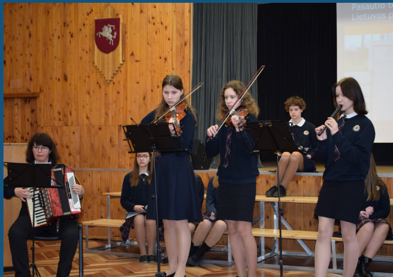
Kėdainiai „Ryto“ progymnasium