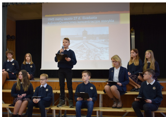
Kėdainiai „Ryto“ progymnasium