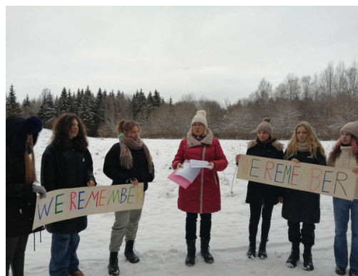
Radviliškis Vaižgantas progymnasium