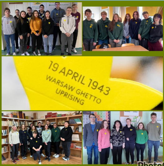
Alytus district Daugai Vladas Mironas Gymnasium

This year it marked the 80th anniversary of the Warsaw Ghetto Uprising. The Polish Museum POLIN shared information about the “Yellow Daffodil” Initiative and invited other countries to join. In Lithuania, 17 institutions (15 schools and 2 museums) joined the initiative after sharing information with the Tolerance Education Centres and partners from other educational institutions. The POLIN Museum sent yellow paper daffodils to Lithuanian academic communities, which were used in the events held on 19 April, which not only talked about the Warsaw Ghetto uprising but also about the battle of good versus evil, about people's efforts to resist the aggressor, and about the lessons of history that humanity has not yet learned.