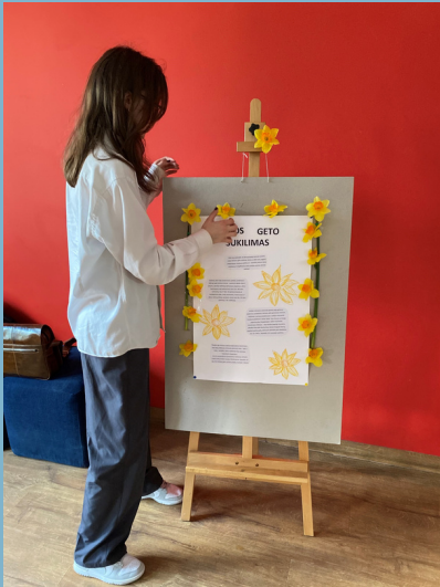
Kaunas University of Health Science Gymnasium