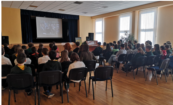
Anykščiai Antanas Baranauskas Primary School