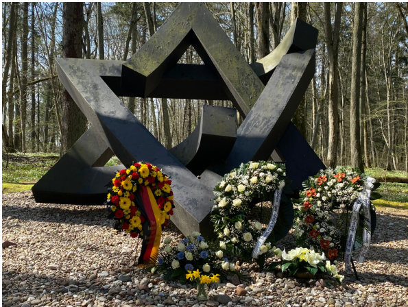
Alytus district Krokialaukis Tomas Norus-Naruševičius Gymnasium

We are pleased to present some of the highlights of the “Yellow Daffodil” initiative in Lithuanian educational institutions: https://www.komisija.lt/en/the-yellow-daffodil-initiative-in-memory-of-the-heroic-warsaw-ghetto-uprising/ .