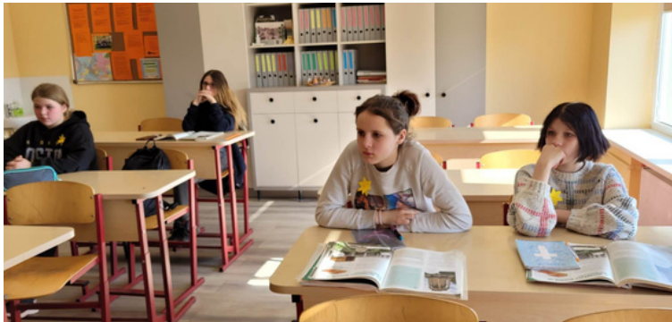
Mažeikiai district Židikai Marija Pečkauskaitė Gymnasium

This year it marked the 80th anniversary of the Warsaw Ghetto Uprising. The Polish Museum POLIN shared information about the “Yellow Daffodil” Initiative and invited other countries to join. In Lithuania, 17 institutions (15 schools and 2 museums) joined the initiative after sharing information with the Tolerance Education Centres and partners from other educational institutions. The POLIN Museum sent yellow paper daffodils to Lithuanian academic communities, which were used in the events held on 19 April, which not only talked about the Warsaw Ghetto uprising but also about the battle of good versus evil, about people's efforts to resist the aggressor, and about the lessons of history that humanity has not yet learned.