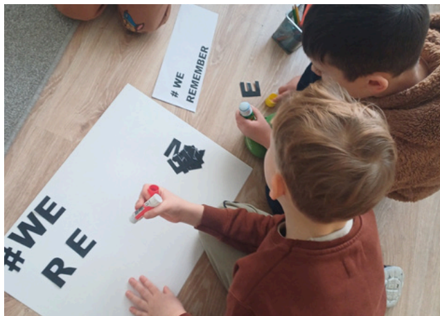
Kėdainiai „Vaikystė“ kindergarten