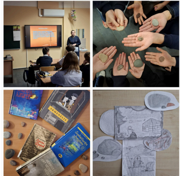
Vilnius „Žaros“ Gymnasium