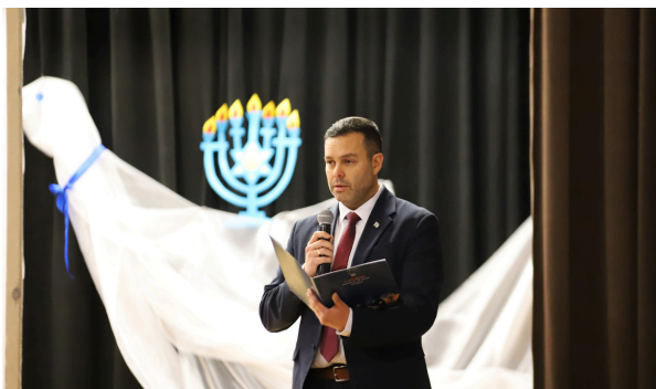
Shimon Pesach, the Deputy Ambassador of Israel